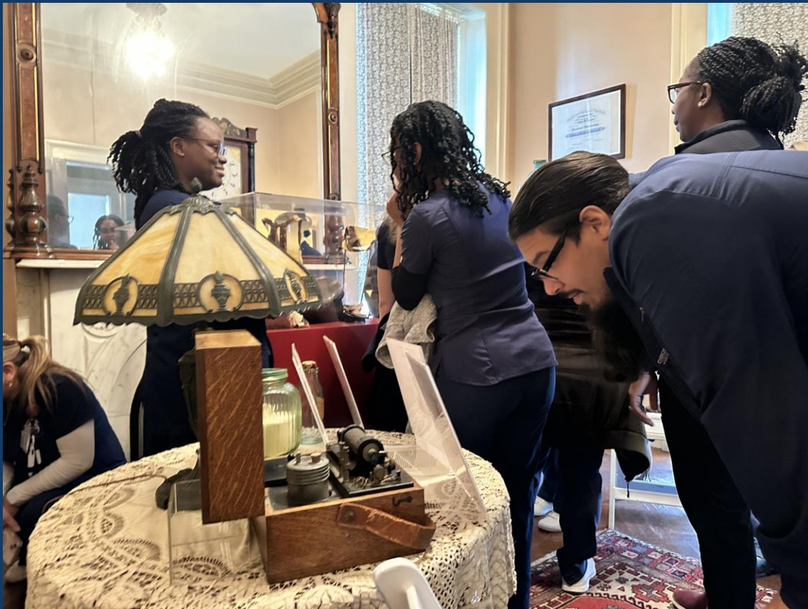
Isham Terry House – 42 Nursing Students